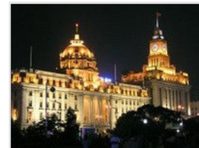
A Tour of China